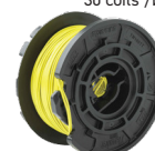
TW1061- PC Polyester-Coated