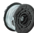
TW1061- EG Electro Galvanize