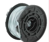
TW1061- S Stainless Steel