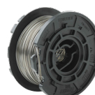
TW1061T Regular Steel